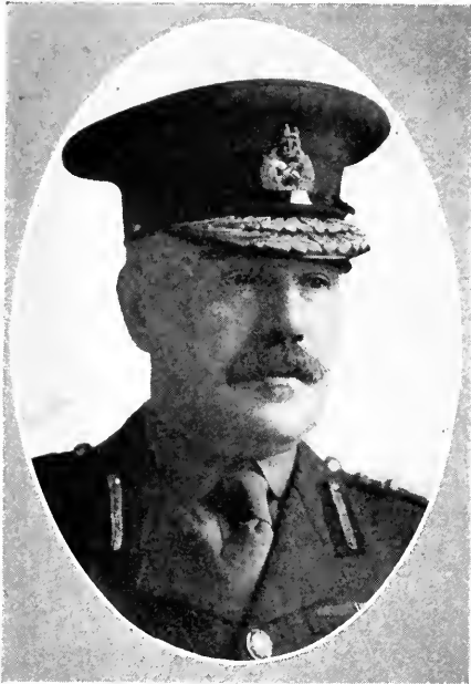
FIELD-MARSHAL SIR W. ROBERTSON, G.C.B.